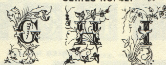
SERIES NO. 421 B4