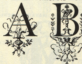
SERIES NO. 442 B4