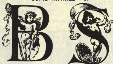
CUPID INITIALS B3