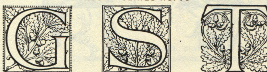
ACORN SERIES NO. 73 B1