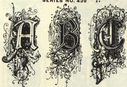
SERIES NO. 439 B4