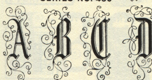
SERIES NO. 430 B4