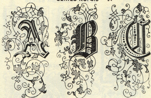
SERIES NO. 416 B4