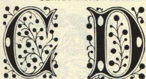
SERIES NO. 311 B3