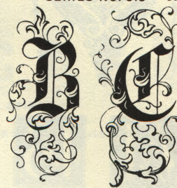
SERIES NO. 315 B3