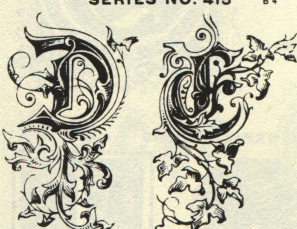
SERIES NO. 415 B4