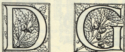
ACORN SERIES NO. 72 B1