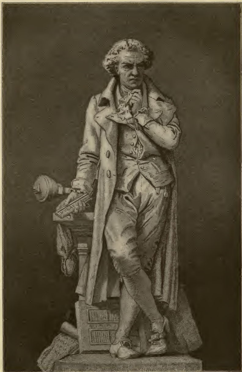
MONUMENT TO BODONI, ERECTED AT SALUZZO, OCT. 20, 1872